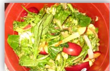
Separate food waste for recycling