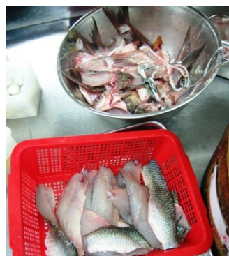
Fish bone/fish head for soup