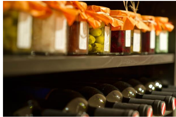
Properly label food in custody