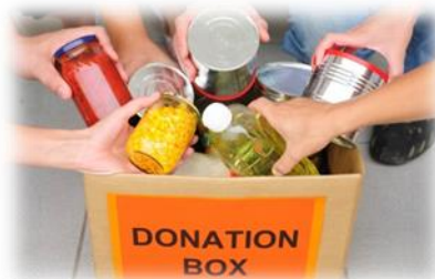
Donate surplus edible food to charitable organizations