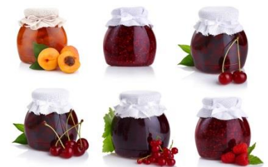
Fresh fruits for jam making