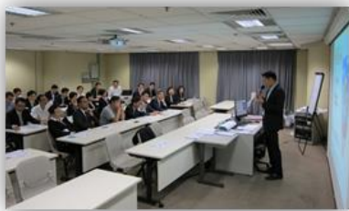
Provide training to staff